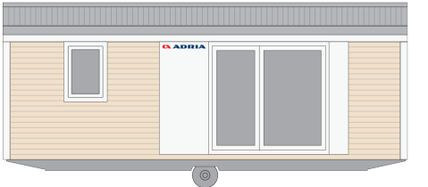
SLine 754 F21