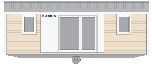
SLine 804 B21 HC