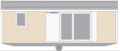
SLine 804 F22