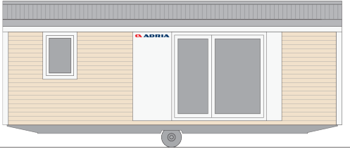
SLine 804 F31T