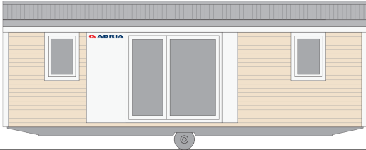
SLine 854 B32