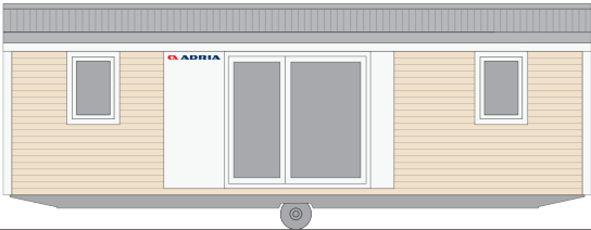
SLine 905 B32